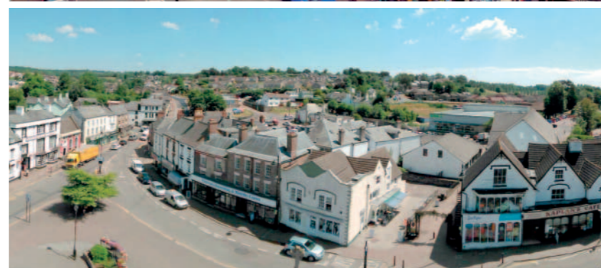
Time to make a difference...your vote will count on how your town is run and how we plan for the future.