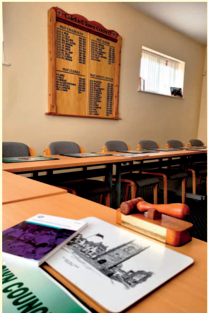
Coleford Town Council chamber

Whatever the makeup of your Council, it is the representation of people's hopes and concerns, ensuring that local services provided are efficient and effective.