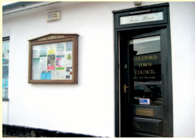
Coleford Town Council offices and chamber are at Lords Hill Walk